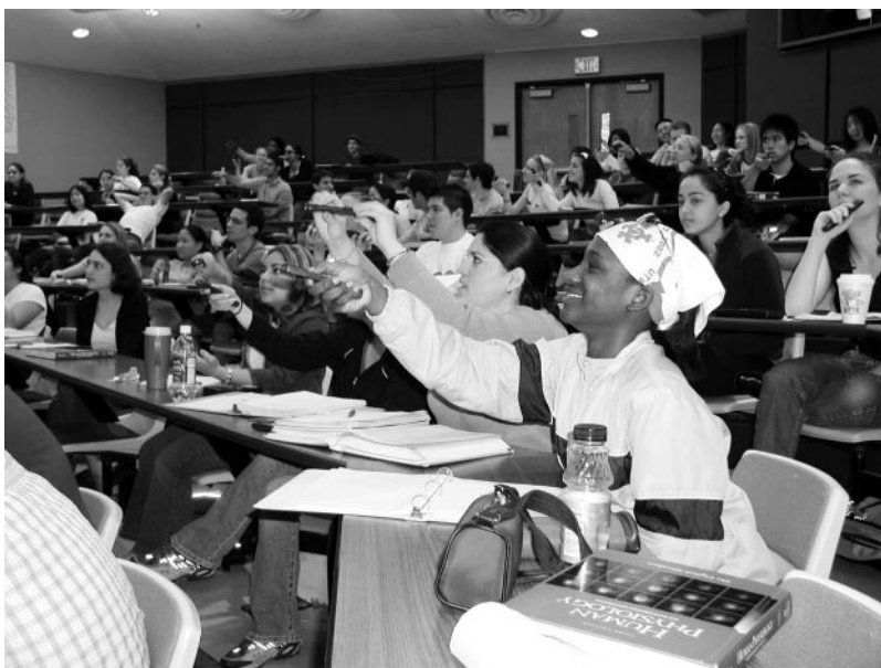
Fig. 2. Students in a large interactive classroom answer questions individually using an electronic response system.